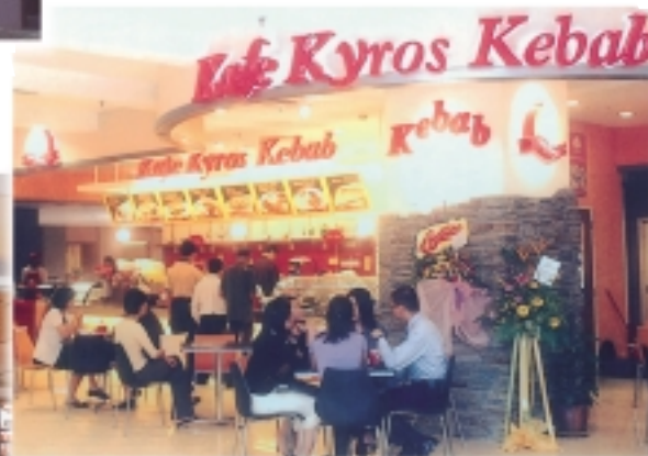
Times Square Kuala Lumpur